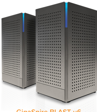
GigaSpire BLAST u6

The GigaSpire BLAST u6 gives you high performance speed, delivering lightning-fast and complete coverage in your home. It is the router that delivers Internet in your home! WiFi 6 technology allows your newest devices to perform their best.