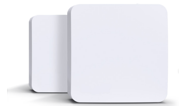
GigaSpire BLAST u4

These WiFi routers are what we use to provide you the best WiFi coverage with our Internet products.